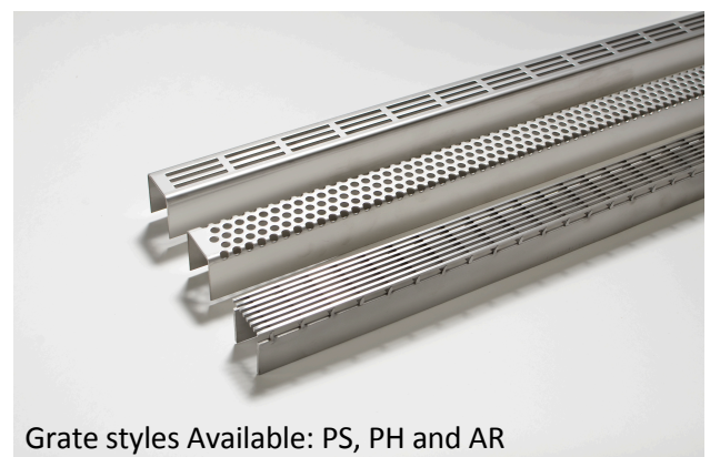
Grate styles Available: PS, PH and AR